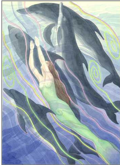
Swimming With Dolphins

I have developed a love of Sacred Geometry that has become, in a sense, a pilgrimage. It is a vast and fascinating field of study. It has added another layer to the artmaking I have done before, and a piece of left brained information that has brought great excitement and balance into my life and constant inspiration to my artmaking.